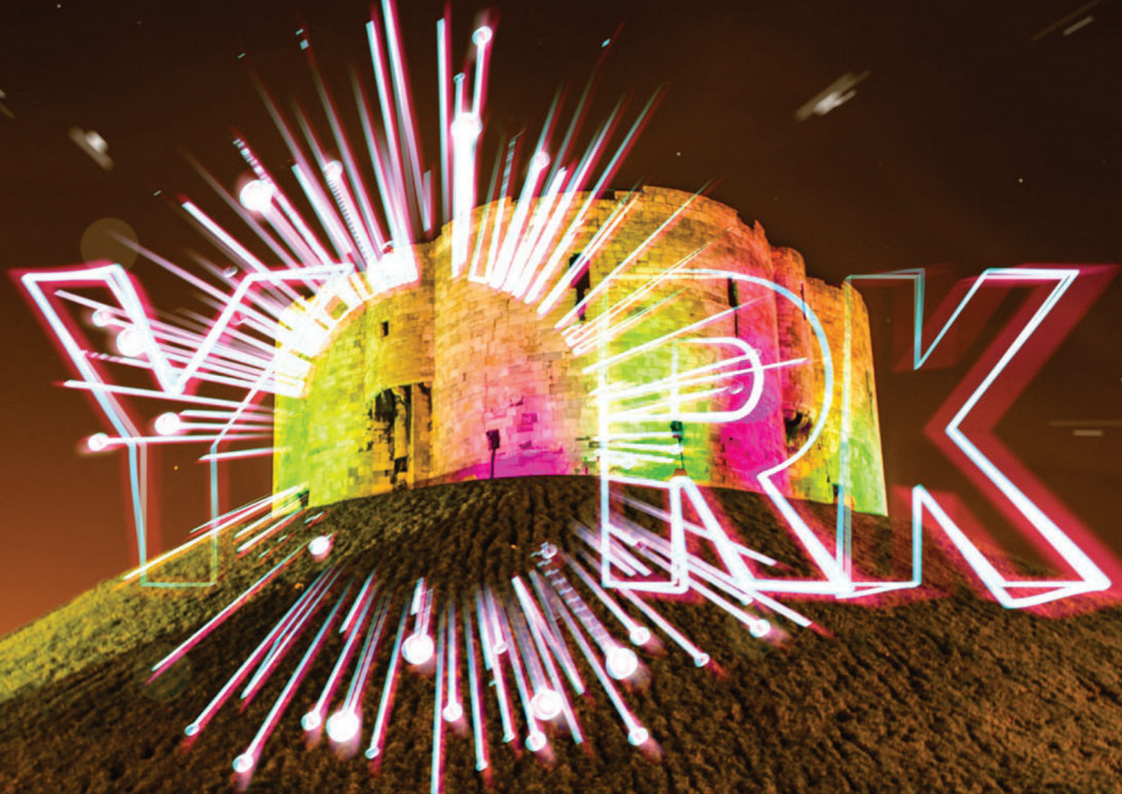
Clifford's Tower in York UNESCO City of Media Arts