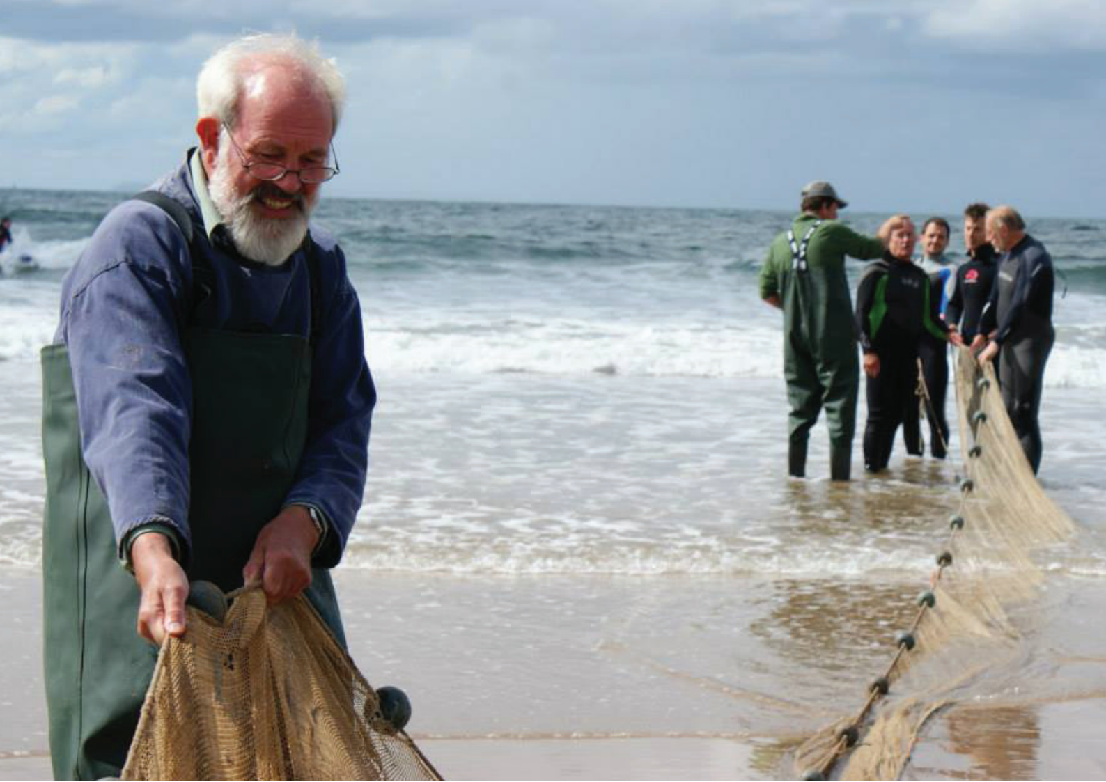
A community group and members of the Marine Biological Association sampling for marine life in the North Devon Biosphere Reserve.