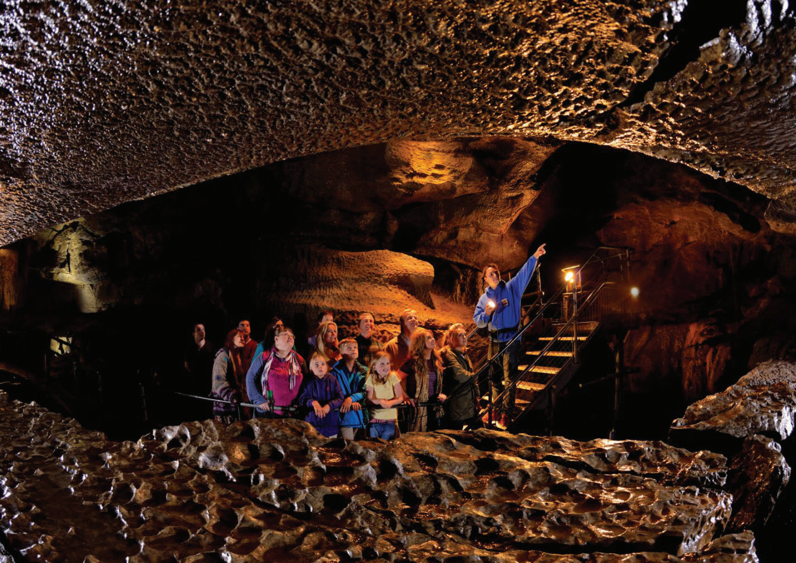
Marble Arch Caves in Northern Ireland