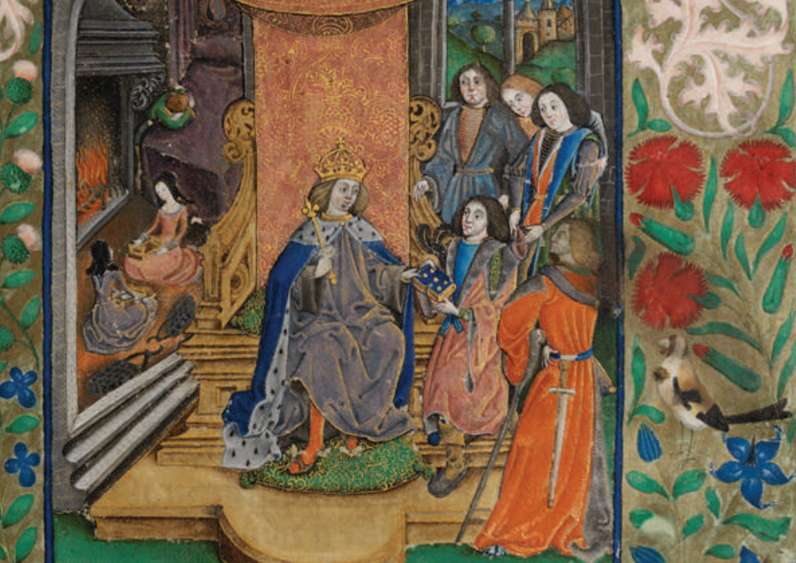
The Peniarth Manuscripts held by the National Library of Wales.