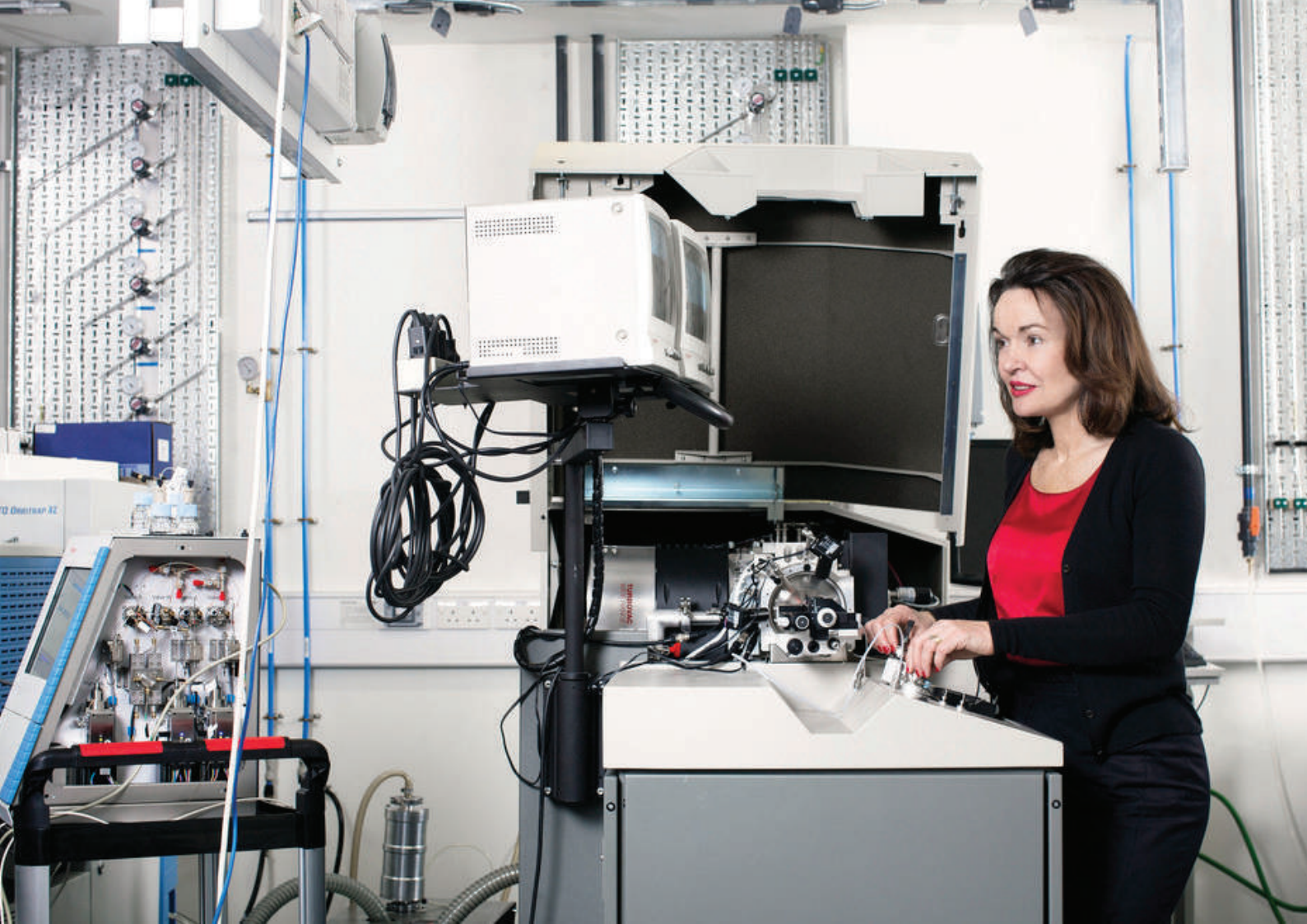
Professor Dame Carol Robinson, Mass Spectrometry, Laureate 2015, Europe (United Kingdom).