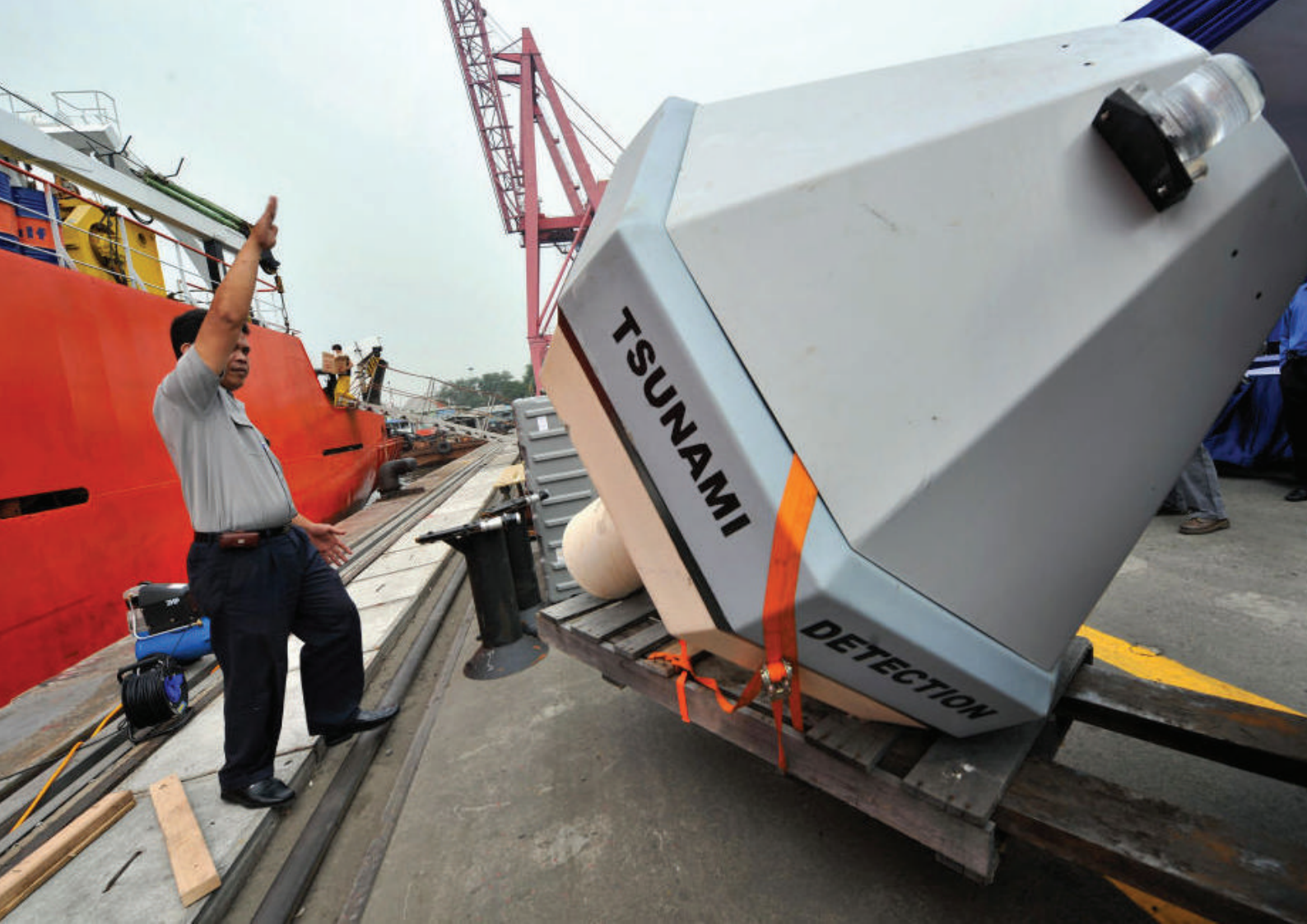
Workers unload a Tsunami Buoy to detect early tsunami warnings.