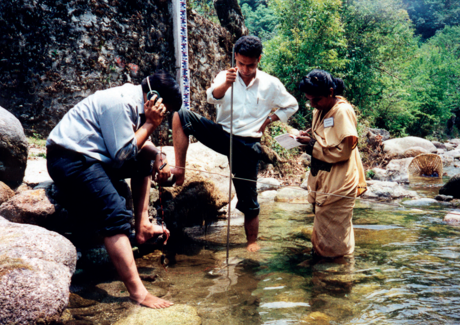
A training workshop on river monitoring taking place under the IHP Hindu Kush-Himalayan FRIEND Programme.