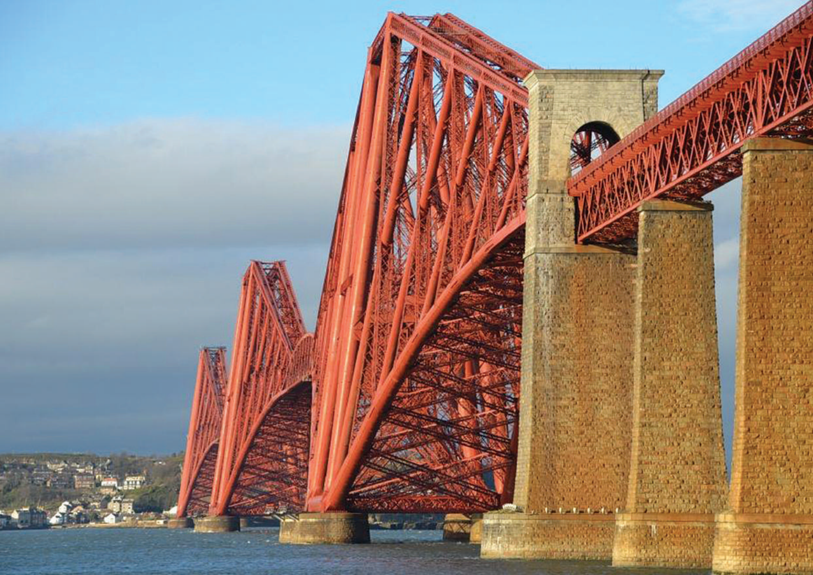
The Forth Bridge, over the Firth of Forth in Scotland.